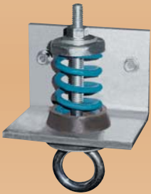
ACH Wood Joist Hanger