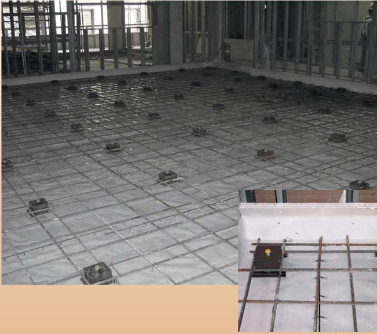
NFF Neoprene Floating Floor